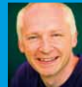
Marcus du Sautoy

Professor Marcus du Sautoy, Charles Simonyi Chair in the Public Understanding of Science, Professor of Mathematics at the University of Oxford and Fellow of New College