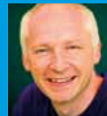
Marcus du Sautoy

Professor Marcus du Sautoy, Charles Simonyi Chair in the Public Understanding of Science, Professor of Mathematics at the University of Oxford and Fellow of New College