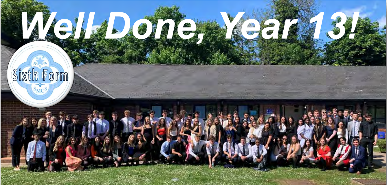
The Year 13s at their celebratory BBQ on Thursday

Students in Year 11 and Year 13 started the main summer exams this week, after completing non-examined assessments, and some other practical subject exams in the preceding weeks.