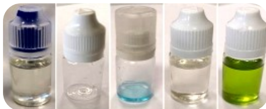
Chemical content includes: ??????

The difference between traditional cigarettes and the act of vaping is that it is very difficult to know exactly the contents of the vaping liquid, chemical compounds or even if it contains illegal drugs.