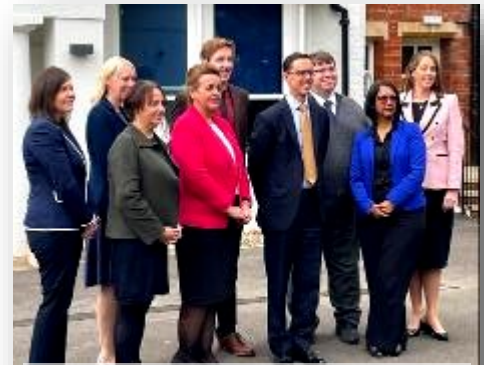
SFACAT Heads met at St. Mary's on Thursday