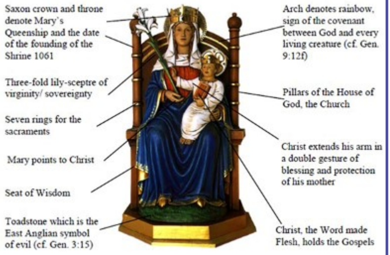
Statue of Our Lady of Walsingham